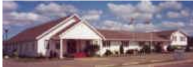
Ferguson Funeral Home of Montague

The family and staff of Ferguson Funeral Homes welcome all the curlers to the Provincial 2009 Stick Curling Championship.