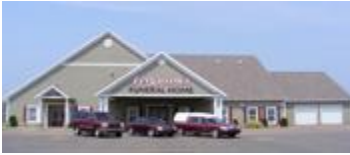
Ferguson Funeral Homes of O'Leary and Tyne Valley

The Ferguson Family is very grateful to be able to offer our services to our communities.