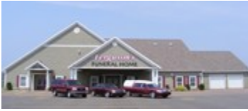
Ferguson Funeral Homes of O'Leary and Tyne Valley

The Ferguson Family is very grateful to be able to offer our services to our communities.