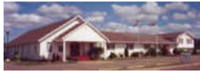
Ferguson Funeral Home of Montague

The family and staff of Ferguson Funeral Homes welcome all the curlers to the Provincial 2011 Stick Curling Championship.